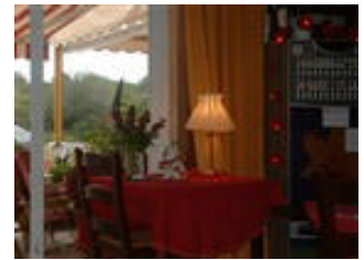
This really is a "turn key" operation.